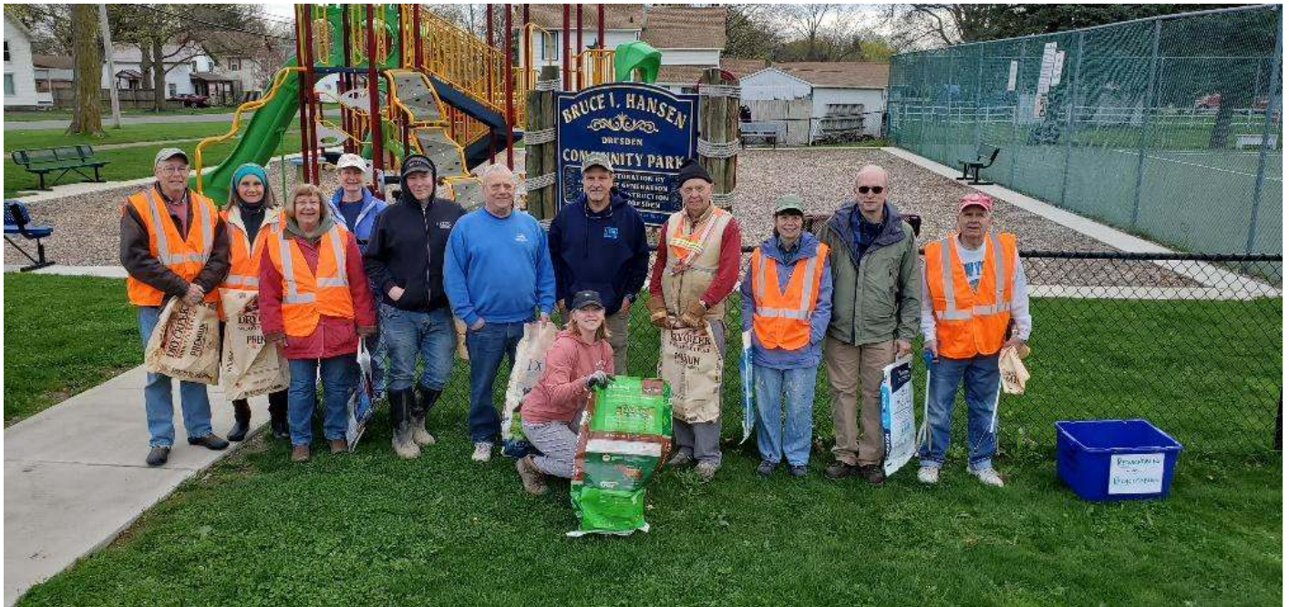
Some of the volunteers who participated in the Torrey EarthDay Cleanup

The Town of Torrey will still hold its annual clean-up for household debris on June 15th. See further details below for acceptable and unacceptable household items at this June 15th event.