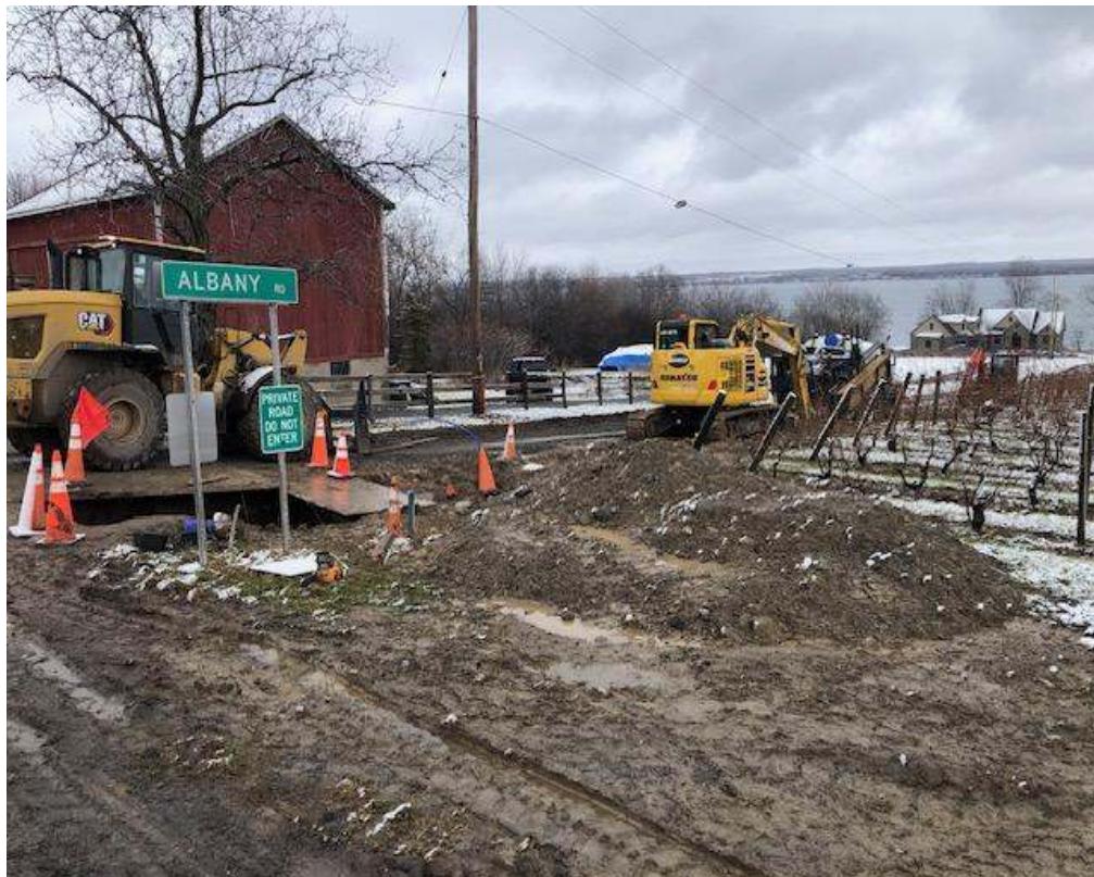
Contractor drilling under Route 14 from East to West at Carlson Road

Next, work continues on Water District One ( WD1 ) with a completion date set sometime in the next few months, if no further unexpected delays occur.