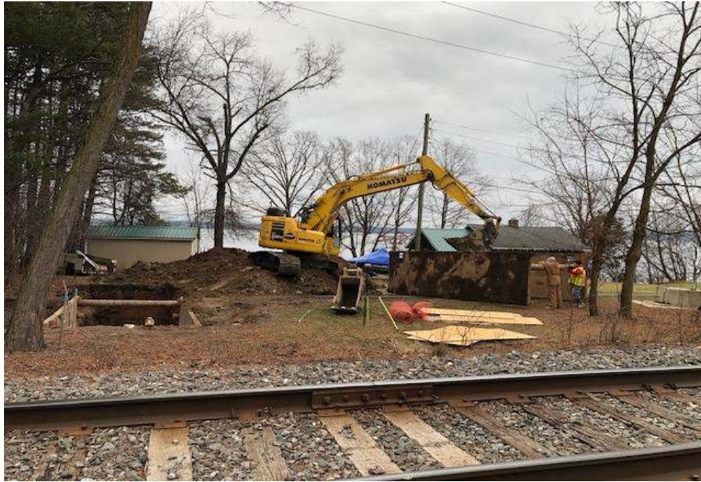
Contractor drilling under Railroad Tracks at North Serenity

In December of 2023, New York State Governor, Kathy Hochul, signed bills to change town elections from odd-numbered years to even-numbered years except for town justices. This means two councilmen seats up for election in November of 2025, will essentially serve three (3) year terms instead of four (4) terms. The two seats up for election in November of 2027 will also serve three (3) year terms. Further, the length of term for Town Supervisor, Town Clerk, and Town Highway Superintendent is changed to four (4) year terms from two (2) year terms. The election for these offices will be in November of 2025 and will be initially for three (3) years to comply with the new state law.