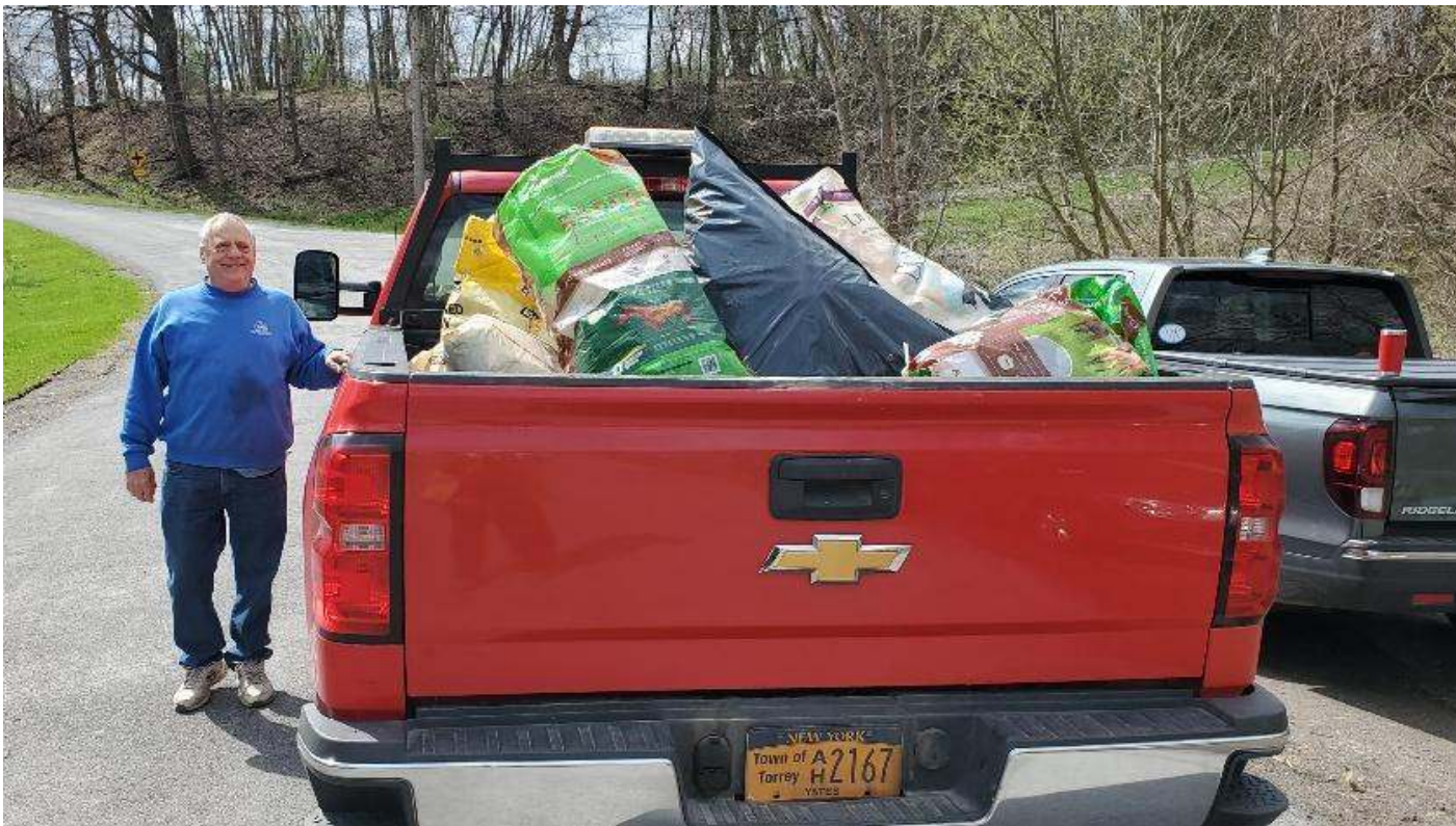
Tim Chambers with a portion of the trash from the Town of Torrey Earth Day Clean-up