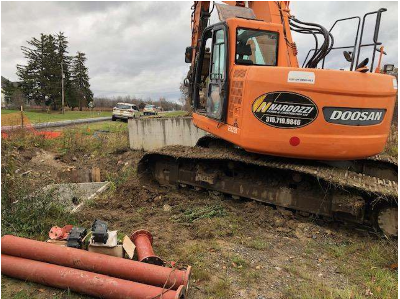
Work on "Meter Pit Vault" across from Fox Run Winery in December of 2023

As the year 2023 has come to a close, I would like to take this opportunity to highlight some of the activities and issues the Town of Torrey experienced this past year. First, in February the Town of Torrey entered into a contract for the construction of Water District 1 (essentially from Fox Run Winery to Seneca Shore Winery along the lake). Unfortunately, the contractor experienced some challenges that delayed progress. At this point after consultation with our engineer, CPL , and the contractor, Nardozzi Construction , we believe they have been resolved and look forward to the project's completion by May of 2024.